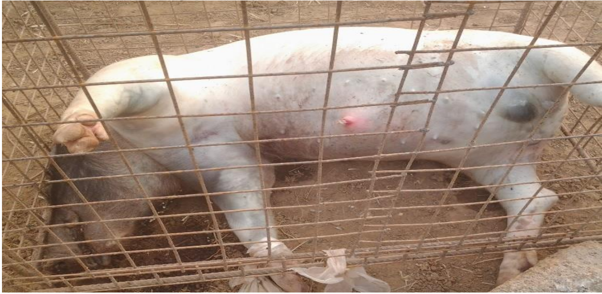
Plate 3 - Active decay state